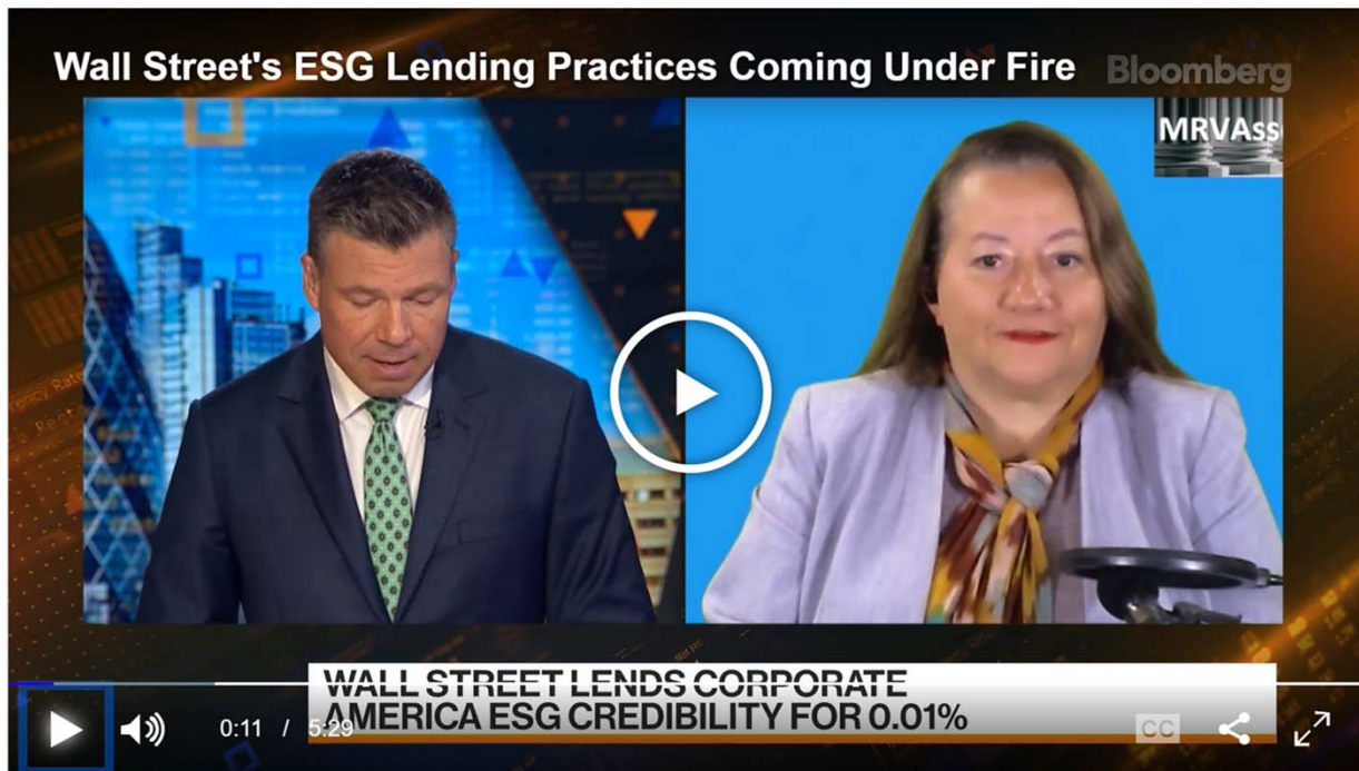
Wall Street's ESG Lending Practices Coming Under Fire

Banks and borrowers are rushing to add sustainability targets to loans, yet for many deals the incentives are all but meaningless.